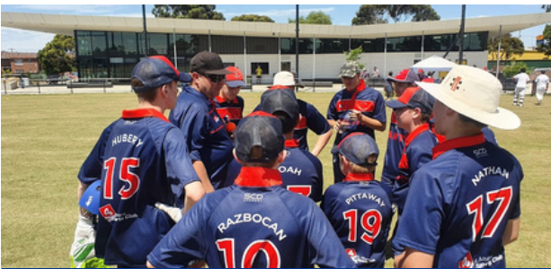
Senior Men's Cricket