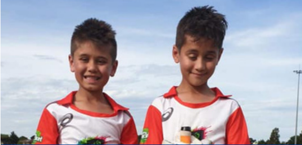
Woolworths Cricket Blasters