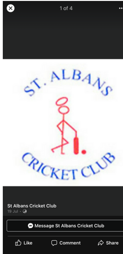
Examples Facebook Business Post & Story