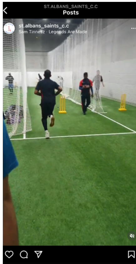
Examples Instagram Business Post & Story